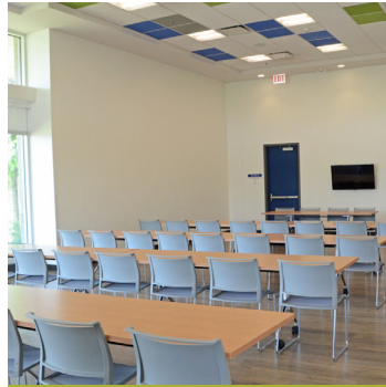
Willow (Room 107)