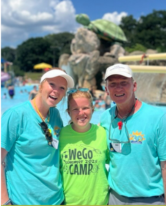
Bickhart Family Various Roles