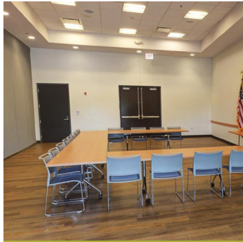
Maple (Room 105)