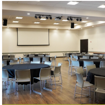
Oak (Room 106)